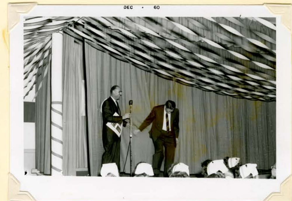
THE BOSS and THE SLAVE