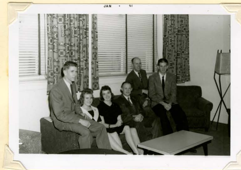
C. V. S. OFFICERS