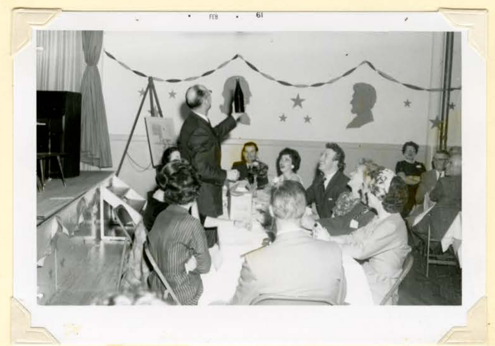
THE FINAL TOUCH