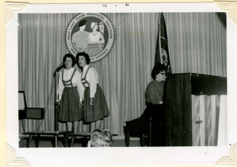
THE MACKAY TWINS