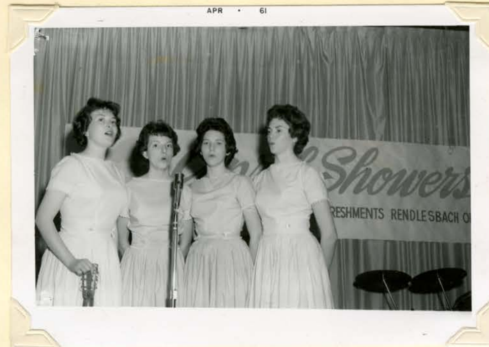
APRIL SHOWERS DANCE