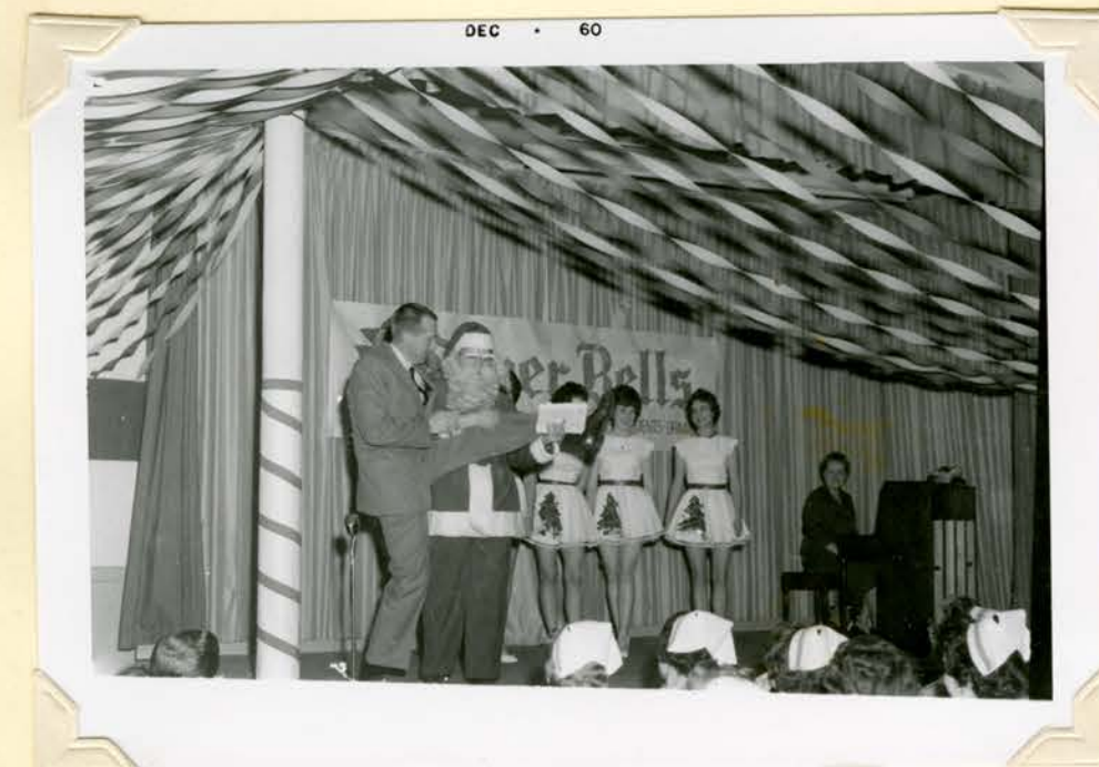
NEED MORE HELPERS?