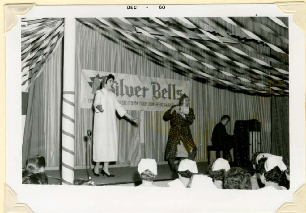
THE NIGHT BEFORE CHRISTMAS