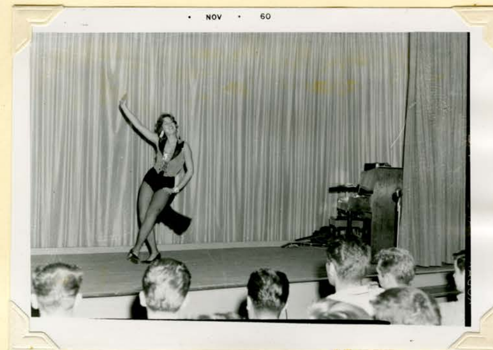
FRED ASTAIRE DANCERS