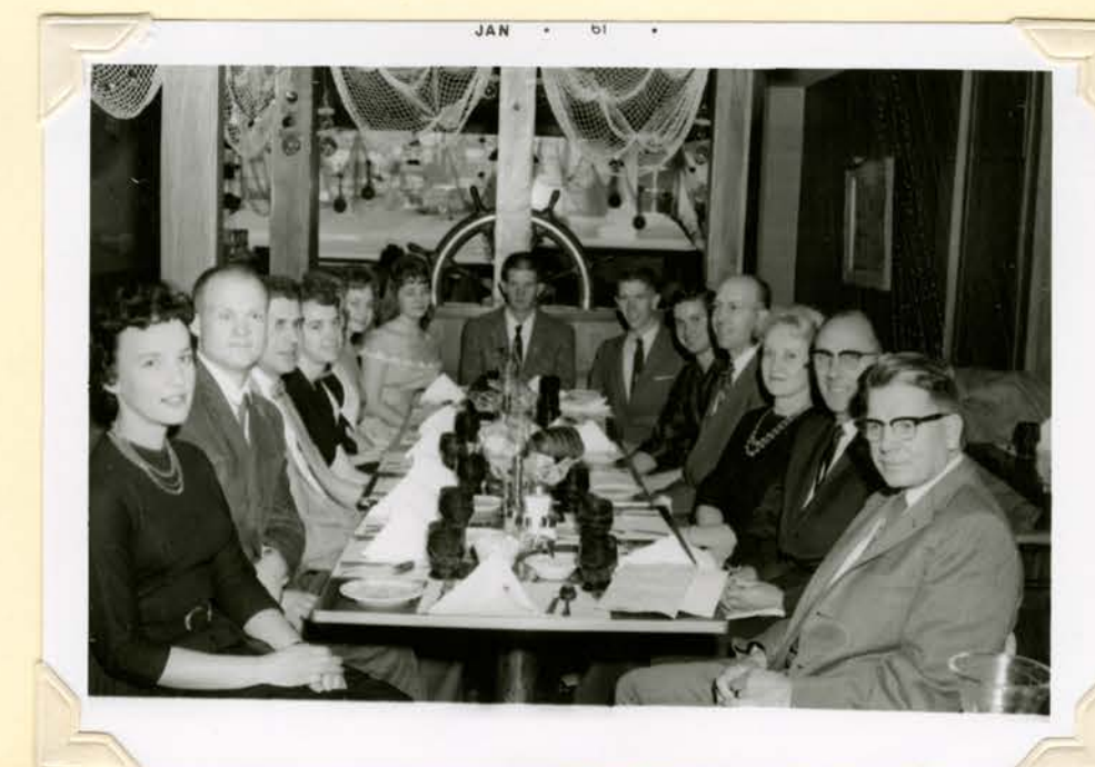
C. V. S. and S. L. T. T. I. OFFICERS and ADVISORS