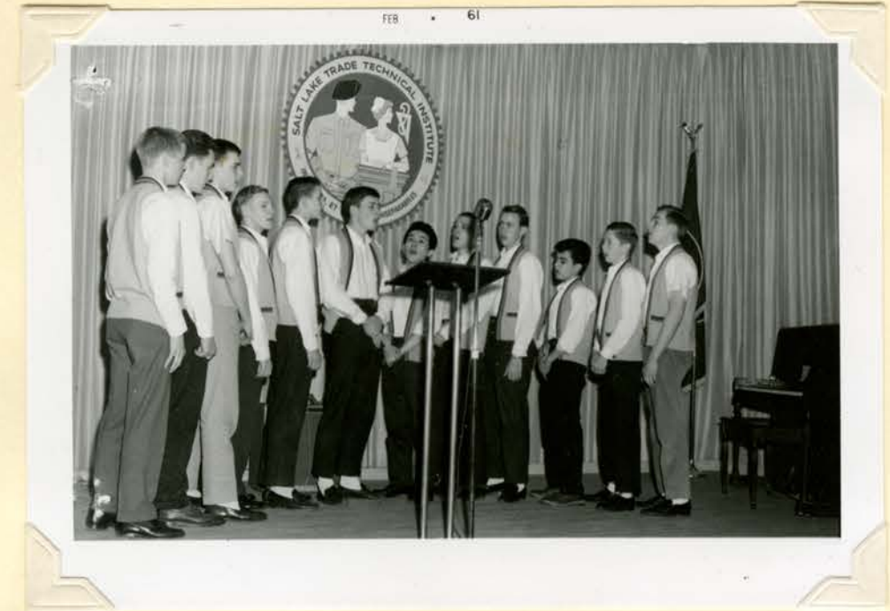
PRESENTATION OF THE SCHOOL GIFT